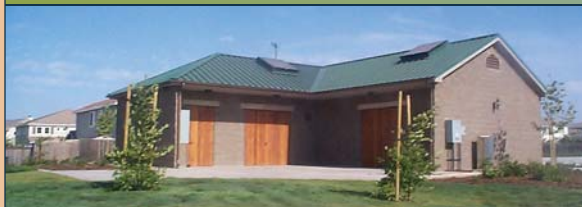
Roseville Production Well Pump Station