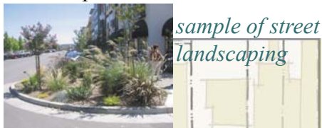
sample of street landscaping

The second public workshop for Riverside Ave streetscape was September 20 with 15 business owners, residents, and interested citizens in attendance. EDAW, the consulting group, was on hand to unveil a proposed plan for the streetscape.