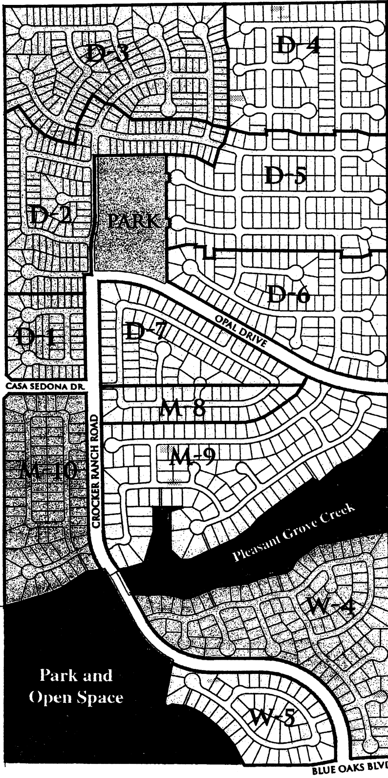
LOT SUMMARY TABLE